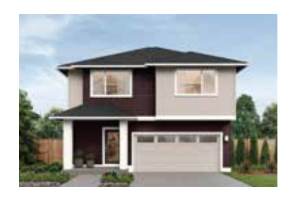
Aurora Nightfall | H Facade