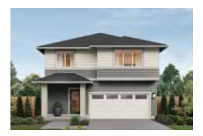
Oceanbreak Nightfall | E Facade

Finished square footage calculations are typically made based on plan dimensions only. Finished square footages vary based on elevation styles, plan options, final home design, variances that arise during construction and other factors. Plans, square footage and house availability may vary by community and are subject to change. Buyers are responsible for verifying the area of their homes. Home prices are not based on, and MainVue cannot assure, final home square footage. Photography is for illustrative purposes and should be used as a guide.