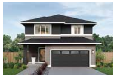
Riverbed Sunrise | D Facade

Finished square footage calculations are typically made based on plan dimensions only. Finished square footages vary based on elevation styles, plan options, final home design, variances that arise during construction and other factors. Plans, square footage and house availability may vary by community and are subject to change. Buyers are responsible for verifying the area of their homes. Home prices are not based on, and MainVue cannot assure, final home square footage. Photography is for illustrative purposes and should be used as a guide.