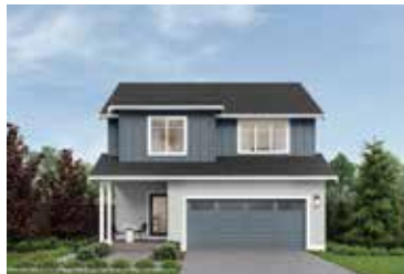
Sky Sunrise | GF Facade