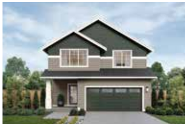
Meadow Sunrise | GH Facade