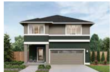
Meadow Nightfall | D Facade

Finished square footage calculations are typically made based on plan dimensions only. Finished square footages vary based on elevation styles, plan options, final home design, variances that arise during construction and other factors. Plans, square footage and house availability may vary by community and are subject to change. Buyers are responsible for verifying the area of their homes. Home prices are not based on, and MainVue cannot assure, final home square footage. Photography is for illustrative purposes and should be used as a guide.