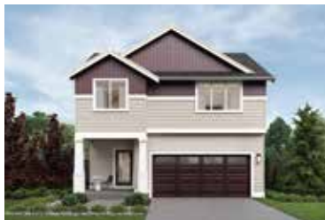
Aurora Sunrise | GA Facade