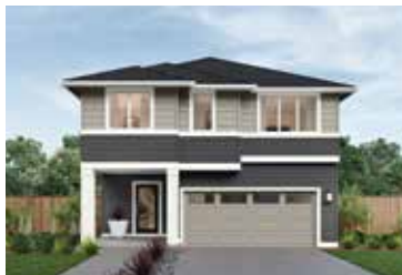
Stormwake Nightfall | E Facade