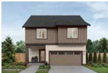
Savanna Sunrise | GF Facade