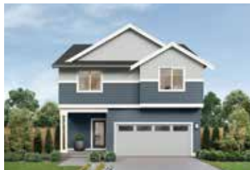
Sky Nightfall | GA Facade