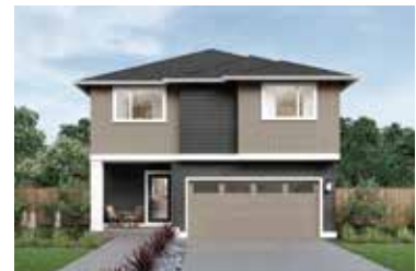
Riverbed Nightfall | H Facade