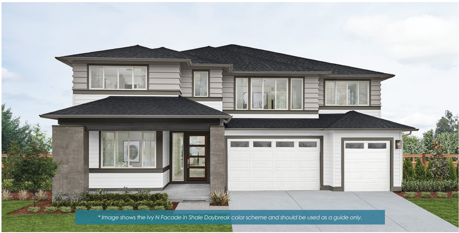
* Image shows the Ivy N Facade in Shale Daybreak color scheme and should be used as a guide only.

Ivy Home Design / 4109 Square Feet / 4 Beds / 3.5 Baths / 3 Cars