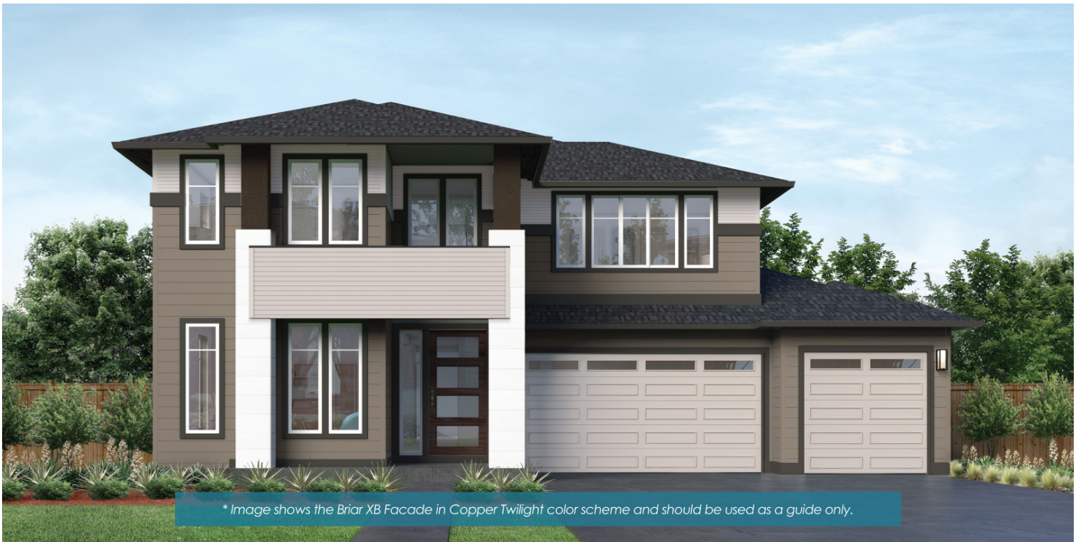
* Image shows the Briar XB Facade in Copper Twilight color scheme and should be used as a guide only.

Briar Home Design / 4055 Square Feet / 4 Beds / 3.75 Baths / 3 Cars