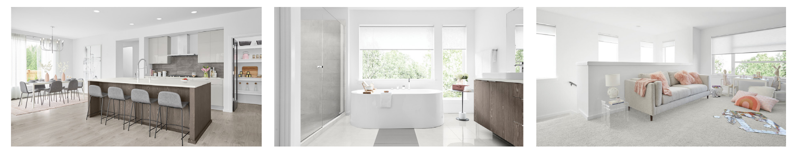
The finished square footage areas provided are calculated based on ANSI Z765-2013 standards as commissioned by the National Association of Home Builders (NAHB). Total square footage used in marketing includes the outdoor room. Finished square footage calculations are typically made based on plan dimensions only. Finished square footages vary based on elevation styles, plan options, final home design, variances that arise during construction and other factors. Plans, square footage and house availability may vary by community and are subject to change. Buyers are responsible for verifying the area of their homes. Home prices are not based on, and MainVue cannot assure, final home square footage. Photography is for illustrative purposes and should be used as a guide.