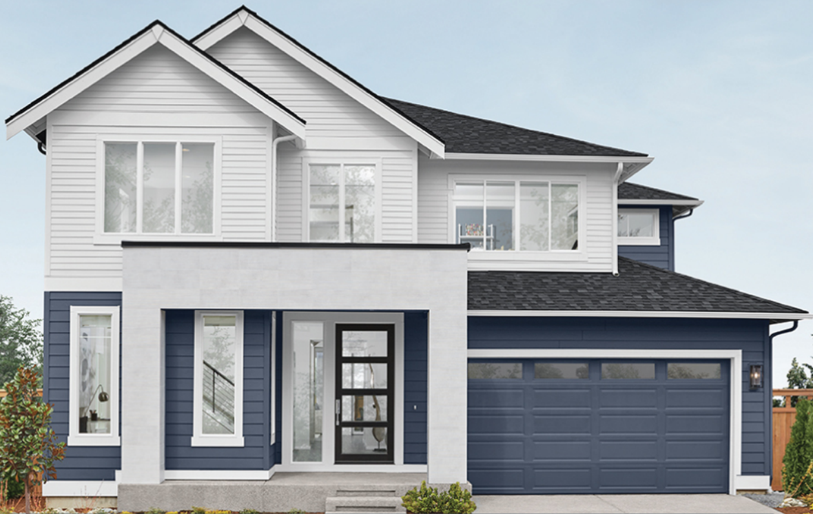
* Image shows the Fuchsia GE Facade in Carbon Twilight color scheme and should be used as a guide only.

— Fuchsia Home Design / 3582 Square Feet / 4 Beds / 2.5 Baths / 3 Cars