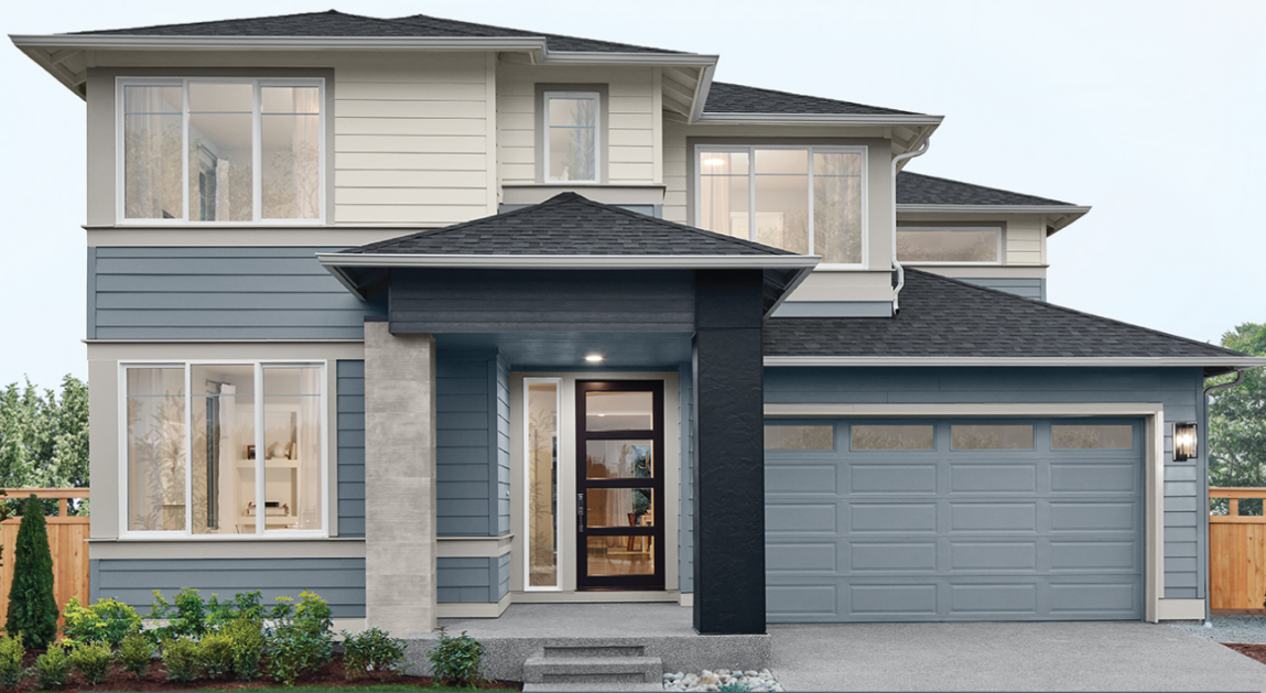
* Image shows the Cypress H Facade in Opal Twilight color scheme and should be used as a guide only.

— Cypress Home Design / 3295 Square Feet / 4 Beds / 2.75 Baths / 2 Cars